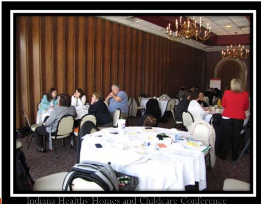
Indiana Healthy Homes and Childcare Conference