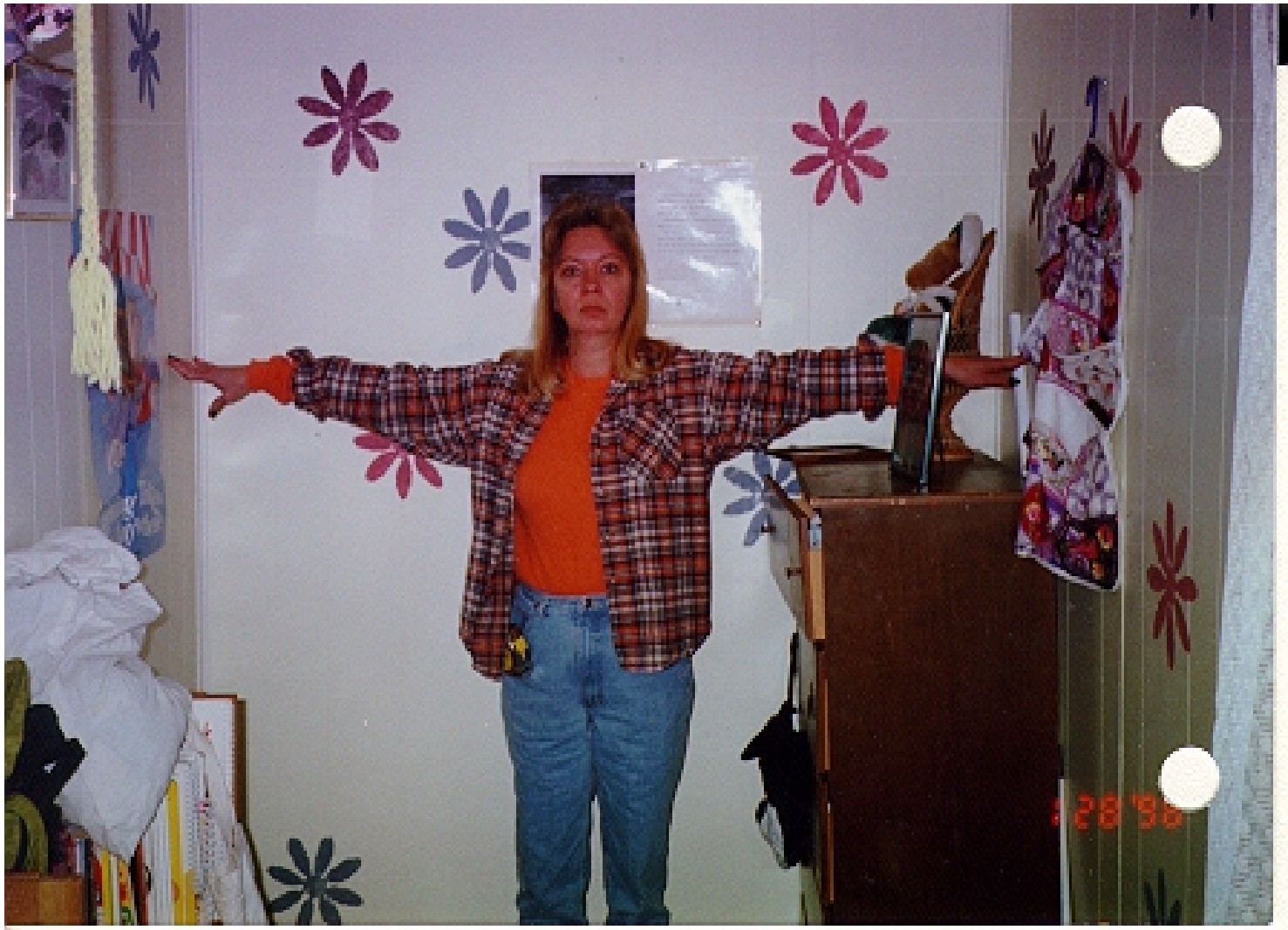
PM404.2 Minimum room dimension at 7 feet.